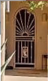
Doors Security Screen Doors