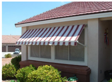
Awnings Window Screens